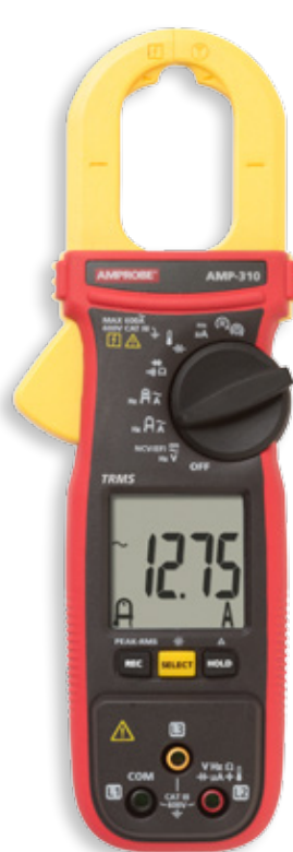
AMP-310 AC Clamp Meter HVAC