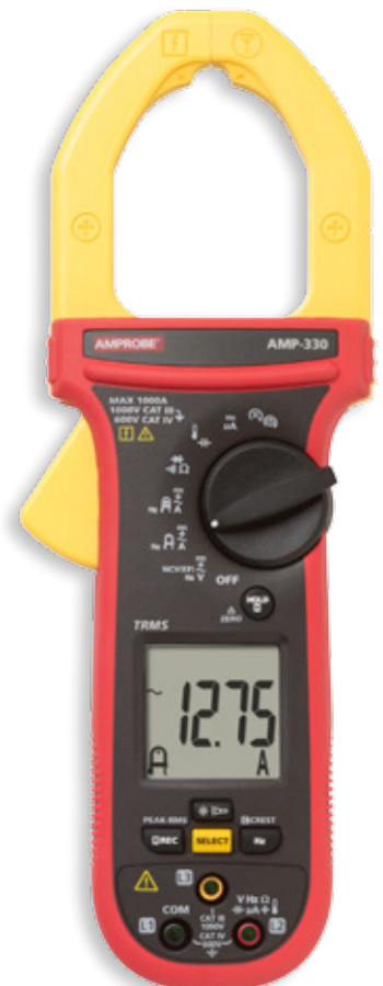
AMP-330 AC/DC 1000 A Clamp Meter Industrial Motor Maintenance